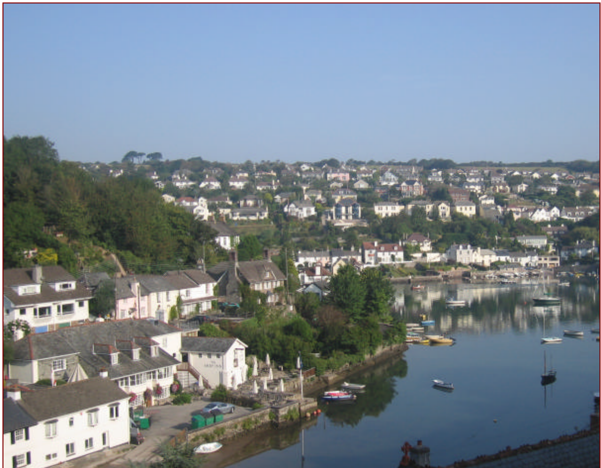
View from property

A well positioned detached village house with superb estuary views, ideal as a holiday retreat or low maintenance main home.